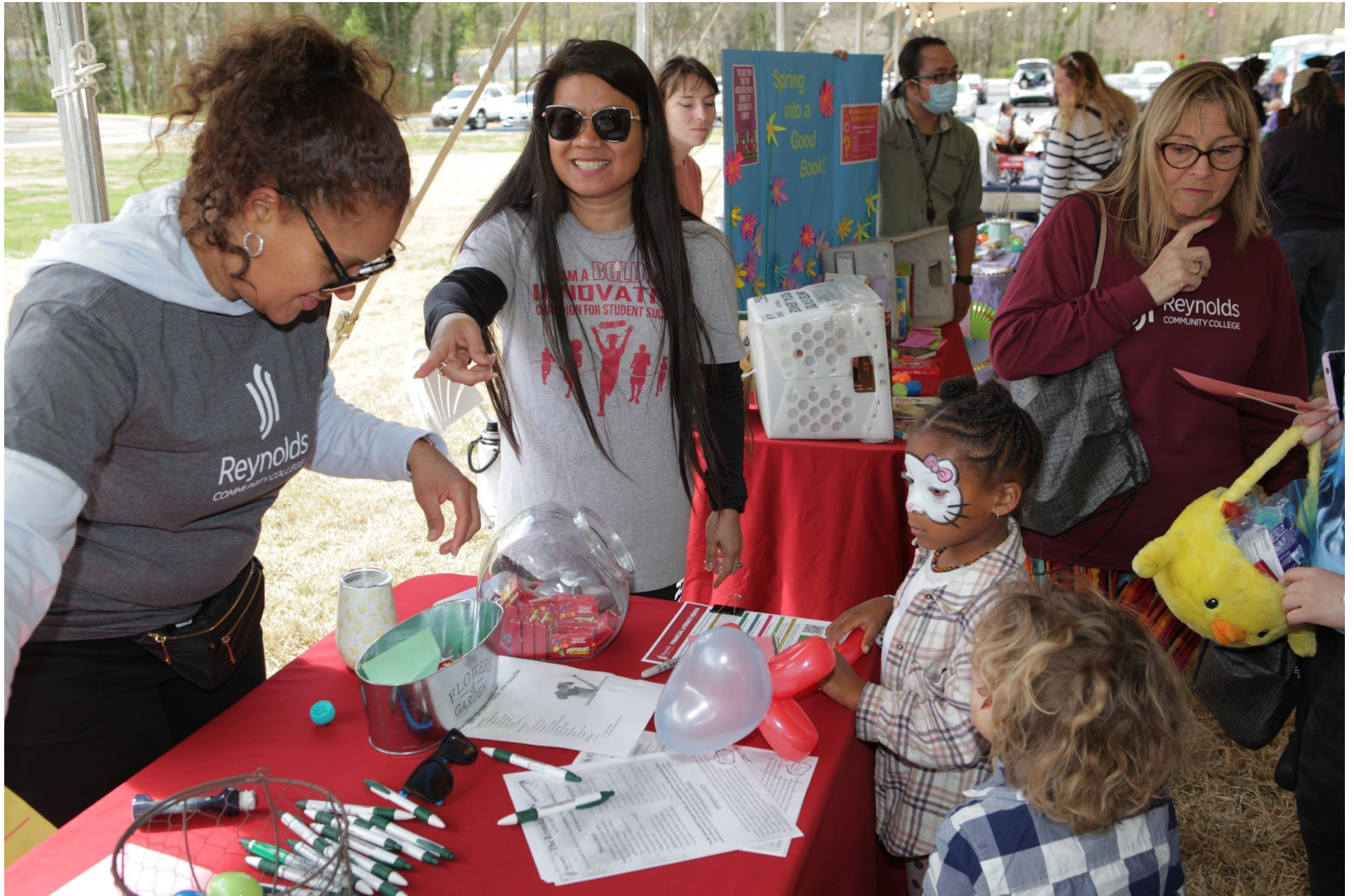
SPRING FLING: Reynolds Community College hosts its inaugural Spring Fling, which featured face painting, the three egg hunts, and special appearances of Flying Squirrels Nutzy and Nutasha. Held on the Parham Road campus, the free event also featured food trucks and safety awareness presentations.