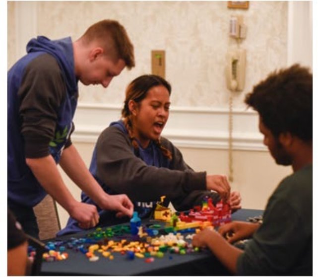
LEGO LESSONS: Students from across Virginia’s Community Colleges took the Student Leadership Conference theme “The Rebuild” seriously, literally and figuratively. Using LEGO blocks to visualize new thinking about connections, the students also built their professional and personal networks, brushed up on communication skills, polished their elevator pitches, and learned more about leadership and service. In service to others, they prepared and packed 20,000 meals for the Rise Against Hunger world food relief project.