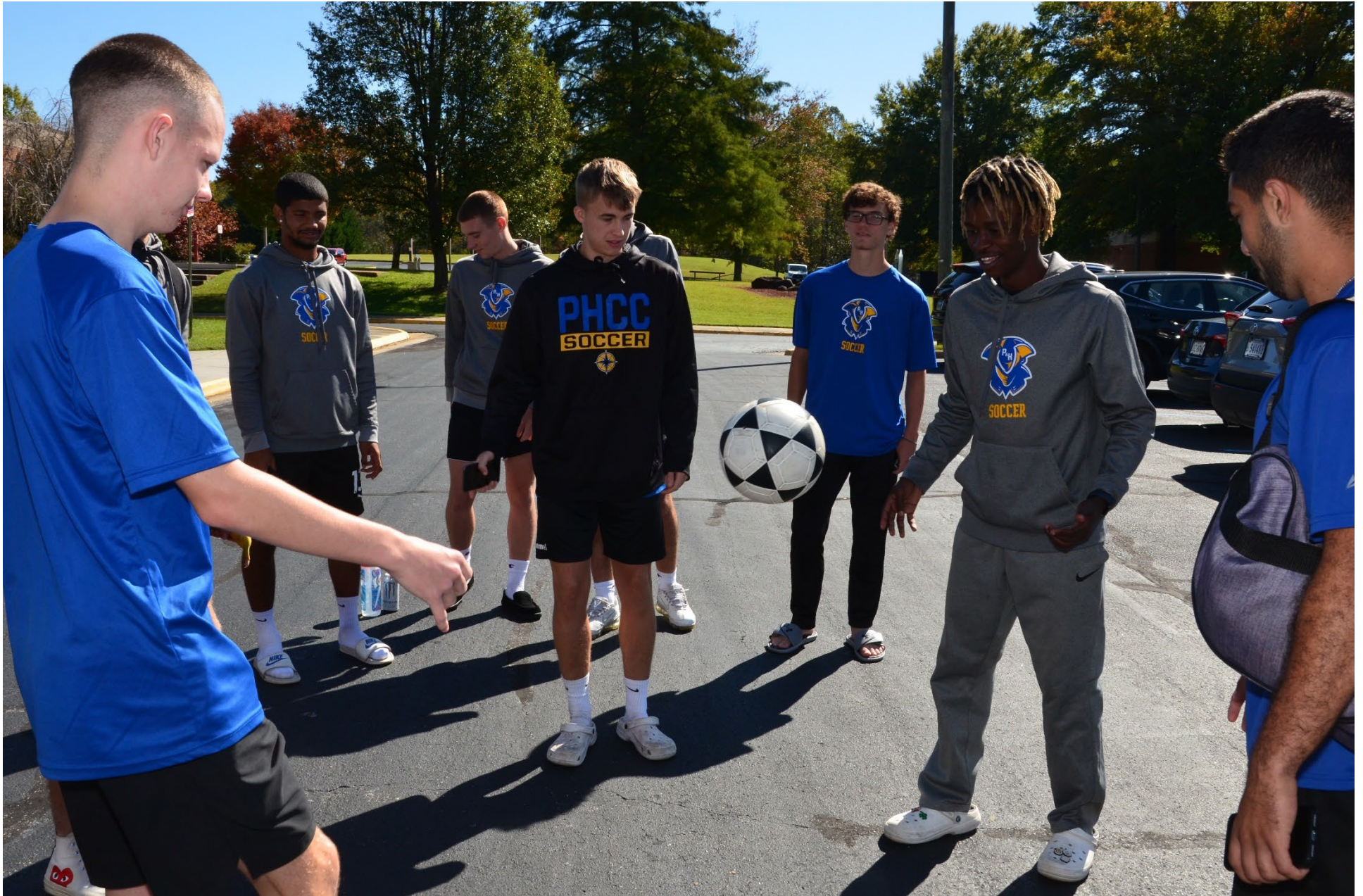
SOCCER FEAT: Members of Patrick & Henry's NJCAA Region X Division II Men's soccer team get a little footwork practice in before the homecoming pep rally.