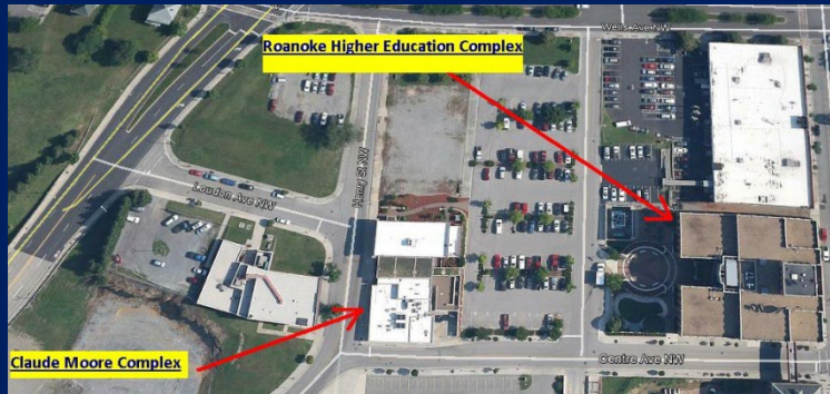
Claude Moore Complex