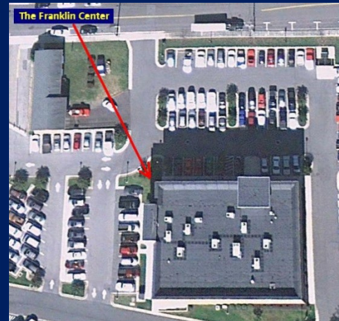
The Franklin Workforce Center